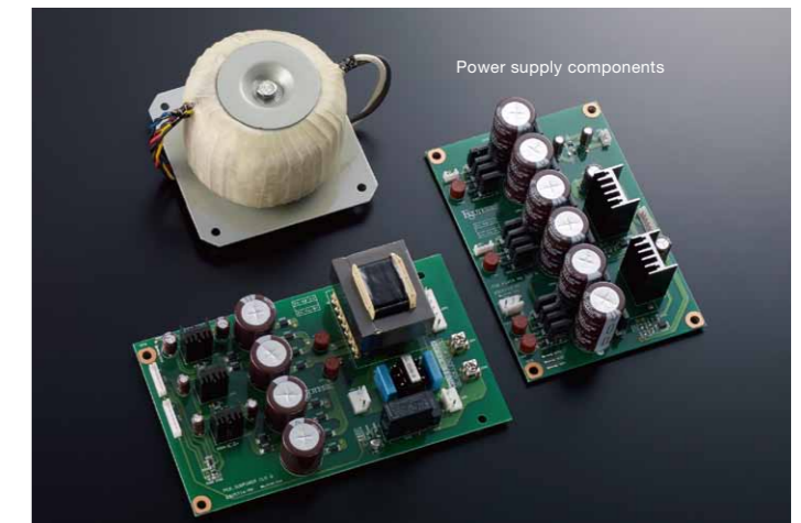
Power supply components

A newly-designed power supply is adopted to maximize the performance of the new “Wide Range Clock Buffer Amplifiers”, with a separate power supply regulator assigned to each of the independent buffer amplifiers. The amplifier and power supply are divided into blocks to ensure drive that is both clean and powerful. A large toroidal transformer is used as the main transformer and a dedicated EI core transformer is used for digital control. A series of multiple capacitors are used for the ripple filter circuit and Schottky barrier diodes are used for quick response to support fast digital processing, which assists the accuracy of the clock's signal generation.