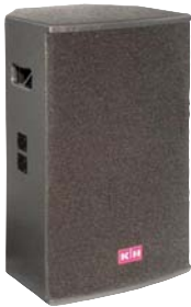
PRO X 12/80 Front, Version: Charcoal Grey