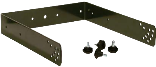
PRO X 12/80 Mounting Bracket LH 12