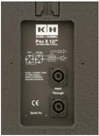
PRO X 12/80 Rear View: Connecting Plate